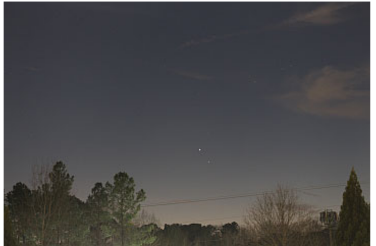
On December 29 Jupiter had moved well past Saturn. Taken with a Canon EOS T5i on a tripod with a 18-135mm lens.