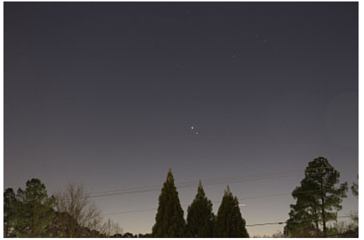
By December 25 their separation had increased more. Taken with a Canon EOS T5i on a tripod with a 18-135mm lens.