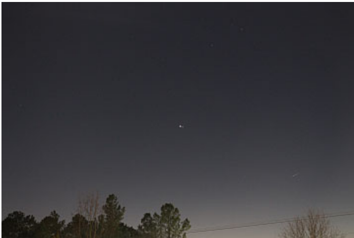
On the night of December 22 Jupiter has passed Saturn. Taken with a Canon EOS T5i on a tripod with a 18-135mm lens.