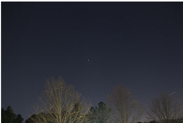
Jupiter approaching Saturn. The above photos are from December 14, 2020, one week before their conjunction. Taken with a Canon EOS T5i on a tripod with a 18-135mm lens.