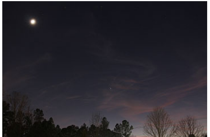
On December 18, Jupiter is closer to Saturn, but the moon has moved farther away. Some high cirrus added some “atmospherics” to the scene. Taken with a Canon EOS T5i on a tripod with a 18-135mm lens.