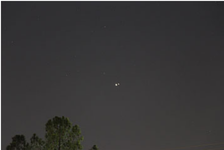
The next clear night was the 21st, the night of the conjunction! Taken with a Canon EOS T5i on a tripod with a 18-135mm lens.