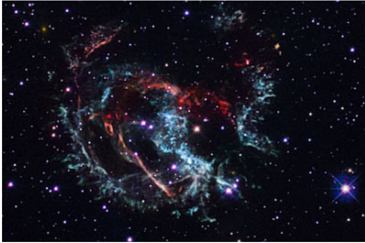
The stellar corpse, a supernova remnant named 1E 0102.2-7219, met its demise in the Small Magellanic Cloud, a satellite galaxy of our Milky Way.