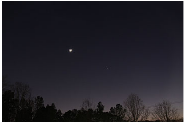
By the next clear night, December 17, crescent moon had passed the two planets. Taken with a Canon EOS T5i on a tripod with a 18-135mm lens.